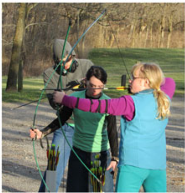
SWOC-SCI Donated $500 to the Hamilton County 4-H Shooting Sports Program

Make a Surprise Release: Target panic is the attempt—and the inability—to hold the pin steady on the intended target while taking a shot. Invariably, the afflicted will issue a "Now!" command in their mind when the pin hesitates on the spot. Trying to time the shot eventually creates a mental gridlock resulting in very inconsistent (and distressing) shooting. The cure is simple, just learn to create a surprise release.